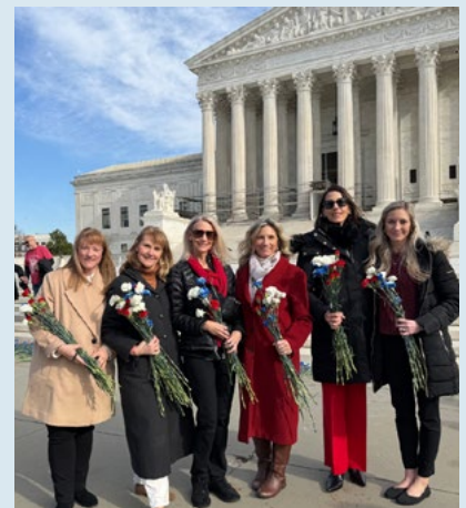
Liberty Counsel, Liberty Counsel Action, and Faith & Liberty D.C. staff gather outside of the U.S. Supreme Court on Jan. 22, 2026, for America250 Remembers: Remembering the Victims of Roe .

On Jan. 23, Life Week culminated with the team marching with tens of thousands of pro-lifers in the March for Life with a Life Reception at the D.C. Ministry Center following the march. All human life is made in God’s image and worth protecting, and Life Week emboldens pro-life advocates in the fight for life.