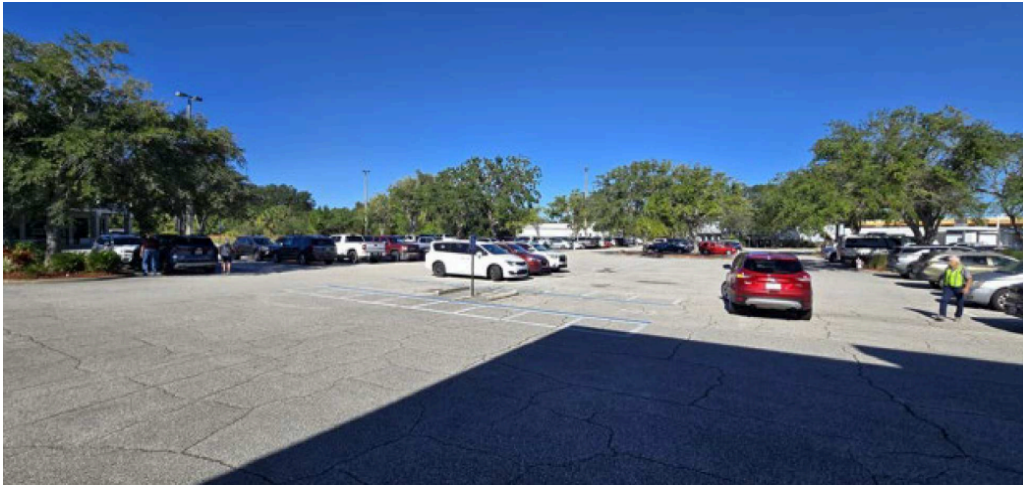
(See Record, Doc. 24, ¶6.)

produced parking records that reveal the Church never used more than 162 of the 315 available parking spaces. (See Record, Doc. 16, ¶5.) During the time Coastal Family Church has held religious services at Flagler Square, parking has remained abundant and available for all tenants. (See Record, Doc. 24, ¶4.).