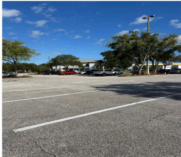
(See Record, Doc. 24, ¶6.)