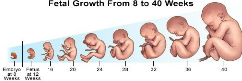
Fetal Growth From 8 to 40 Weeks