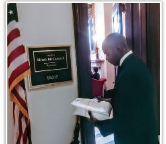
Petitions delivered to Senator Mitch McConnell from Kentucky.