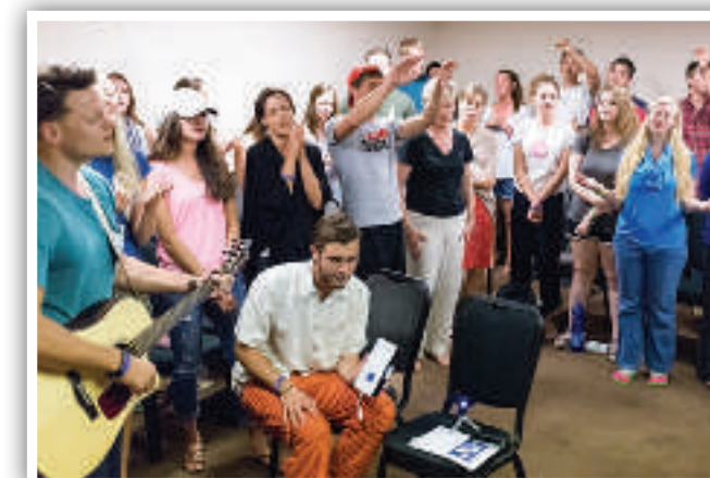
Students worshipping in Israel.

Learn more about Christians In Defense of Israel at CIDIsrael.org . Visit CovenantJourney.org to get more information about our breakthrough ministry to Christian college-aged leaders.